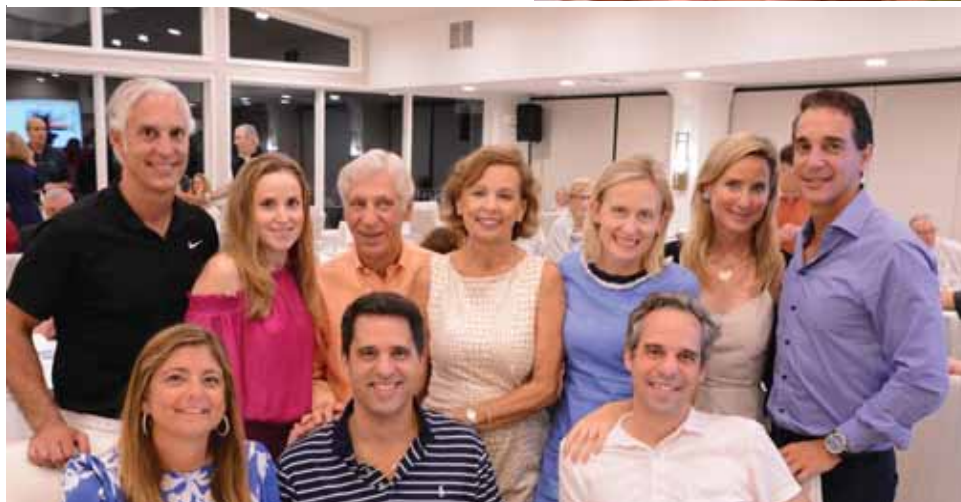
The Salvatore Family