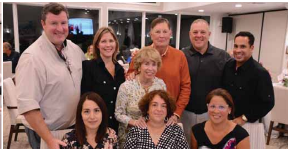
The Feighery Family